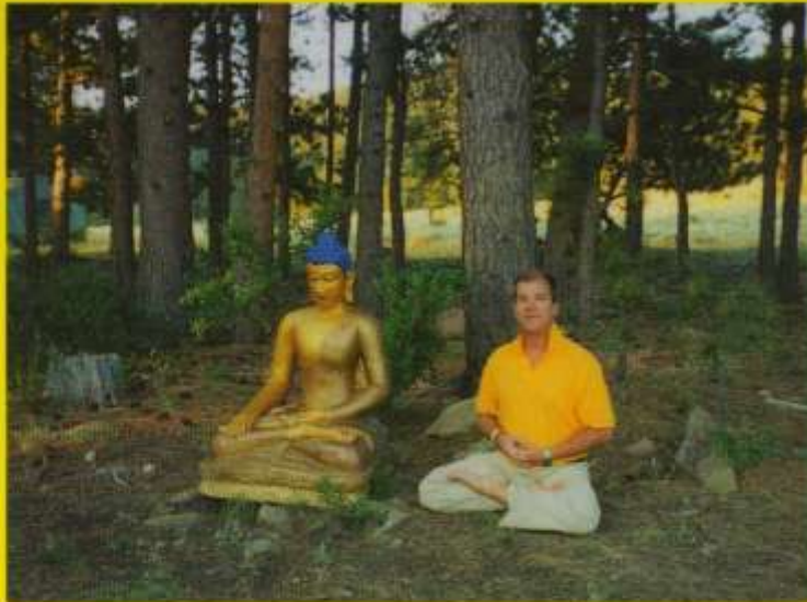
The author at a retreat center next to a statue of Buddha

Meditation and the teachings of The Buddha have become increasingly popular in this modern-scientific-information age. People from all walks of life have found meditation and the Buddha's teachings helpful for overall health, relaxation, and wisdom. The Buddha's core teaching is in the Eightfold Middle Path and the many other lists of The Buddha. The author guides us through this time-less teaching by explaining the meanings and steps. A total of 90 lists are presented in this book with 29 of the most important ones explained in detail, including the four evolutionary stages of religion in the Foreword.